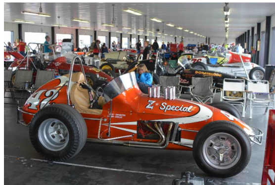
The display of antique race cars

Members of our Northeast Pennsylvania Mercedes Benz car club were afforded an opportunity to participate in a classic car show scheduled to be held prior to the Pocono Raceway Verizon Indy Car race that was scheduled for Sunday August 21st, 2016. Three of our member's automobiles were accepted by the race committee for inclusion in the