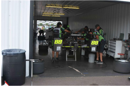
Preparing the cars for the race.

A number of our members used their free tickets to return Monday to view the rescheduled race. The 200 lap race was won by Penske team driver Will Powers who benefited by a crash by his teammate and points leader Simon Pagenaud.