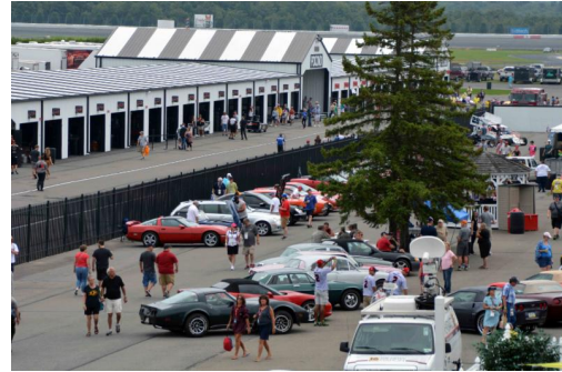
The car show