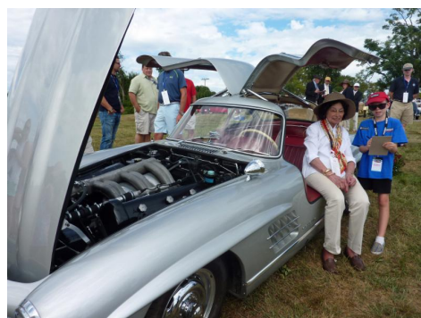
1956 300SL Gull

On October 8, my mom and I went to the AACA Hershey Fall Meet. It's the biggest car show in the world. I judged 5 old cars with about 10 other Hagerty Youth Judges. My favorites were a 1908 Cadillac and a 1958 BMW Isetta. Afterwards, I had chocolate milk at Hotel Hershey. See you next year.