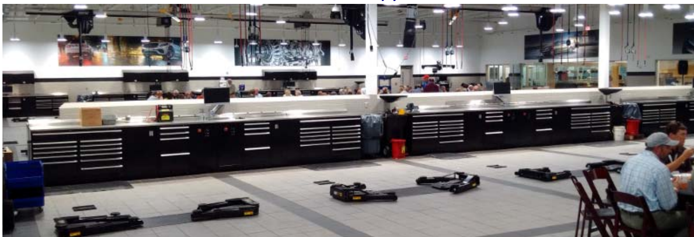
(Half of the dinner attendees are sitting in the other half of the shop past the center row of toolboxes.

After our tour, we attended the Friday night reception at Mercedes-Benz of Birmingham (Irondale Campus). It was held as an elegant buffet within their very large and immaculate 20 bay Service area. It was difficult to believe that Benzes had been worked on in this room earlier that day. It was pristine and the dinner was perfection. More and more, it was becoming evident that attending this event not only aided in our learning more about the vehicles, but also about the other attendees who enjoyed their vehicles as much as we did.