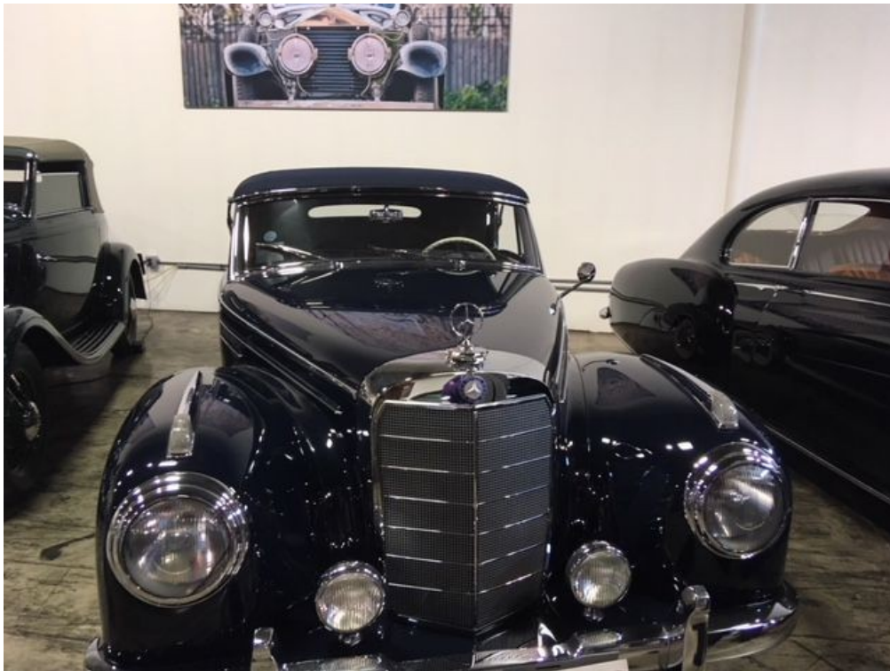
1956 MB 300SC. This Cabriolet is one of only 49 built.