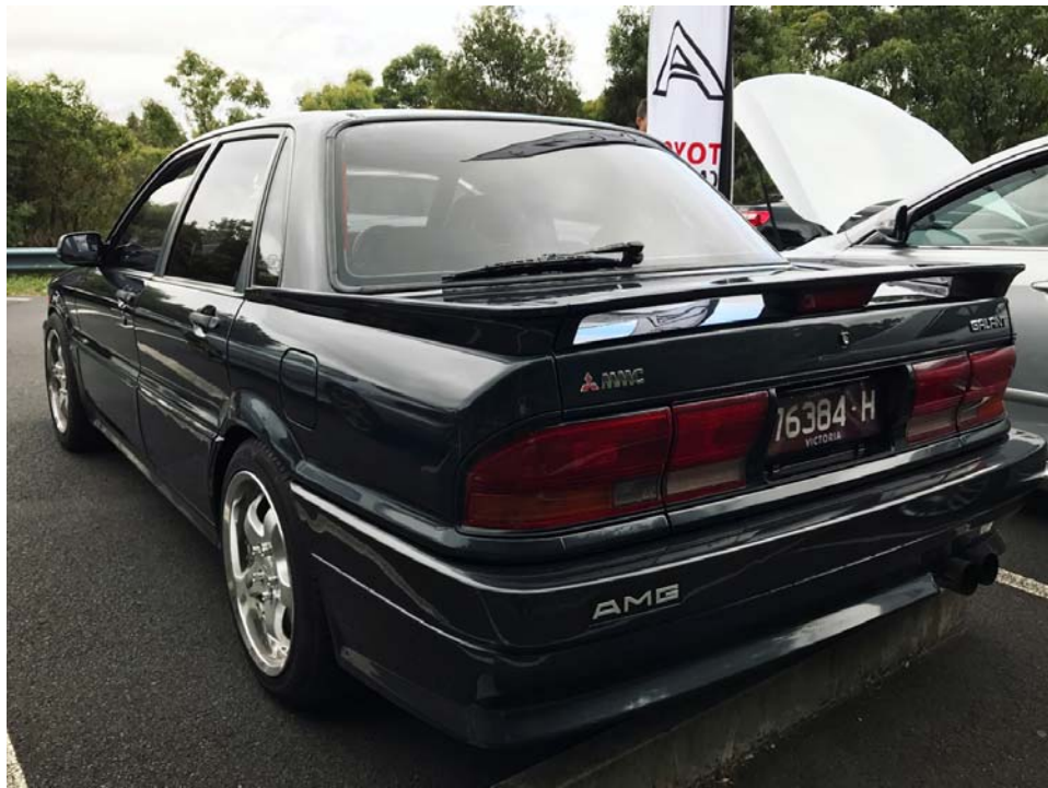
Figure 1: 1989 Mitsubishi AMG Galant

The VR-4 is a legend in automotive history. It was the Galant's performance version. It is also the car that forged the way for the iconic Lancer Evolution. Before Mercedes acquired AMG, the tuning company had built an AMG-badged Galant for the Japanese market.