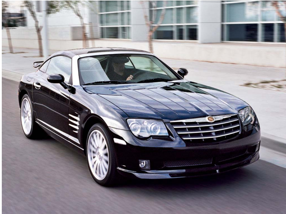
Figure 2: 2005 Chrysler Crossfire SRT-6

Under the Crossfire shell lies the first-generation Mercedes-Benz SLK roadster platform. Being an American vehicle, fans of the Street & Racing Technology cars expected the Crossfire SRT-6 to be powered by an American engine.