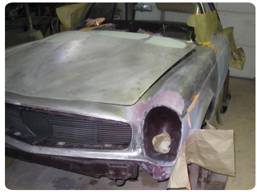
Above: First part of repairs.