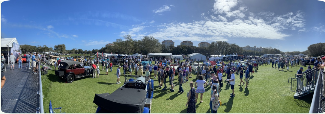
One of the three fairways from Sunday's Concours.

Let me start by saying this. For those of you who have never been to the Concours before, you are missing out. It is a great weekend and an even better way to kick off the spring driving season.