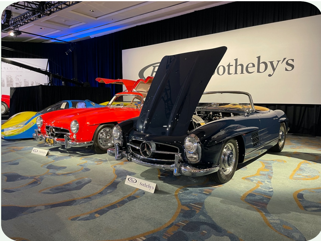
Pair of 300SLs. From left to right: 1950 coupe in red over tan with Rudge wheels sold for $2,040,000; 1962 navy blue over tan Roadster that brought $1,545,000.

After watching this, we went over to the Ritz Carlton to walk around the RM Sotheby's preview for their Saturday auction. The first Mercedes they had on offer was a 1988 560SL with just over 17,000 miles that brought $58,240. This was followed by a stunning 1953 300 S Cabriolet A that failed to meet its low estimate at $621,000. RM had a pair of 300SLs. The first to cross the block was a beautiful navy blue over tan 1962 roadster that brought $1,545,000. This was followed up by a 1955 coupe in red over tan with Rudge wheels. This car was sold for $2,040,000, but keep in mind that the wheels alone are said to be 10% of that price. For the more modern enthusiast, there was a 2015 SLS AMG GT Final Edition that failed to meet the reserve. The final two Mercedes had to offer was a 1972 600 SWB sedan and a 1971 280SE 3.5 coupe. The 600 sedan was spectacular with only 3,300 original miles and brought a very strong number at $445,000. The 3.5 coupe presented nice on the exterior but had flaws underneath, but still brought $109,000.