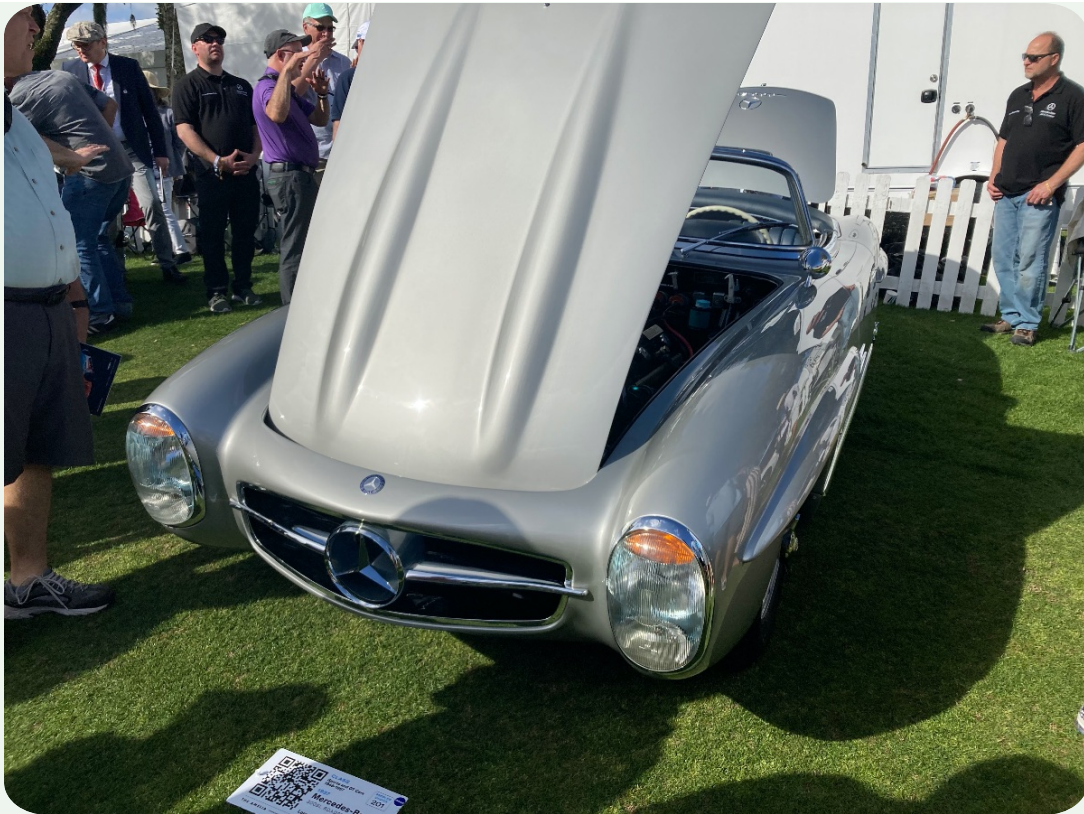
Sunday's Concours one Mercedes. Only 300SL roadster to leave the factory without bumpers.

Now for what everything has been leading to, the Sunday Concours. For the Mercedes-Benz enthusiast, this was a little disappointing. There was only one Mercedes on the entire field, however, it was a one-of-one car. It was the only 300SL roadster to leave the factory without bumpers. Yes, this is correct, you could order your brand new 300SL without bumpers back in the day. The biggest reason why no one ticked this option was that you would not get any money back in doing so. People would simply remove the bumpers themselves and store them on the shelf. Other than the disappointing turnout of Mercedes, it was a great show as always.