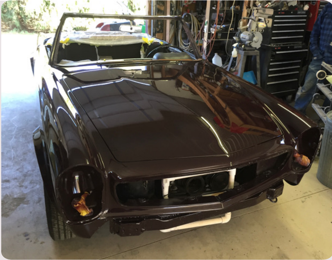
The SL was then taken to a specialist paint shop for the final painting.