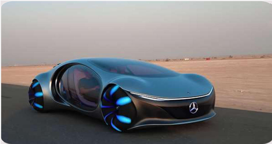
Mercedes VISION AVTR

The Mercedes Benz VISION AVTR (Advanced Vehicle Transformation) is the future for electric powered cars. With its four high-performance and near-wheel-built electric motors, the VISION AVTR embodies a particularly agile implementation of the vision of a dynamic luxury saloon. With a combined engine power of more than 470 HP (350 kW), the VISION AVTR sets a new benchmark for EQ Power. Thanks to the intelligent and fully variable torque distribution, the power of the four fully individually controllable motors is not only managed in the best possible way in terms of driving dynamics, but above all in a highly efficient manner. The innovative all-wheel drive with torque vectoring enables completely new freedoms and guarantees driving dynamics at the highest level while at the same time providing the best possible active safety.